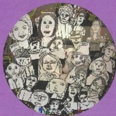
Samford Public School Year 10 'Inspired by Women'

TAFE NSW EORA COLLEGE 333 Abercrombie Street Chippendale NSW 2008 5:45pm - 7:00pm