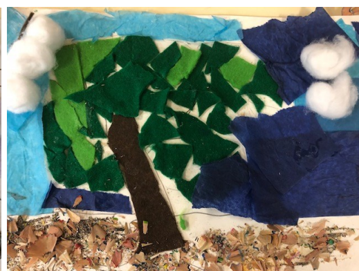
Top Left by Iris